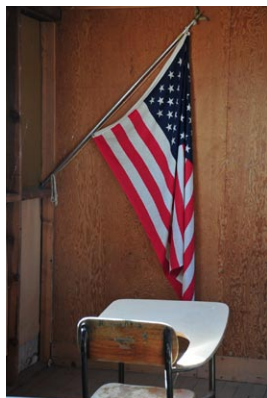
Recreated school interior