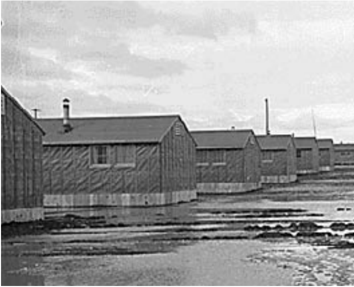
Minidoka after the rain, 1942