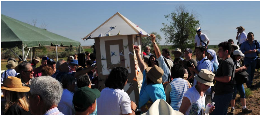
Images from the 2008 Pilgrimage