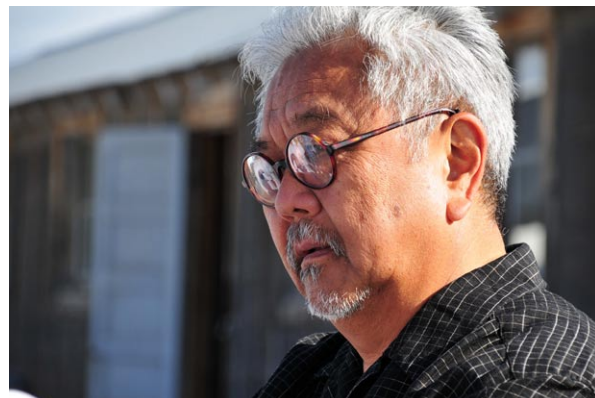
Roger Shimomura, Univ. of Kansas Distinguished Professor Emeritus